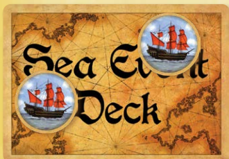
Event Deck with Progress Counters

At the start of the game, decide whether you want to play with the Sea Event Deck. You may use the Sea Event Deck with any combination of Red Dragon Inn characters, even ones from other editions of The Red Dragon Inn. If you decide to play with the Sea Event Deck, shuffle the deck and place two Progress Counters on top of it. Leave space next to the deck for its discard pile. If you run out of cards in the Sea Event Deck, shuffle the discards and use that as the new Sea Event Deck.