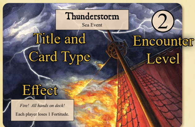
A Sea Event Card

The Sea Event Deck offers an optional play variant for games of The Red Dragon Inn. When you play with the Sea Event Deck, you are leaving the relative safety of The Red Dragon Inn and are instead drinking and carousing in the Captain's cabin on board The Crimson Drake while it is at sea. Because you are out on adventure, you run the risk of being interrupted by random encounters. Some of the encounters are relatively safe, while others are very dangerous!