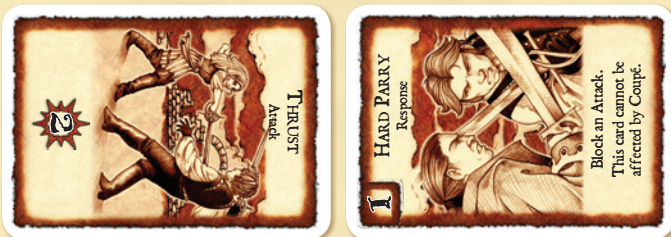
Recommended placement for Responses

Response: Response Cards are played directly facing an Attack Card to block or otherwise mitigate damage from that Attack.